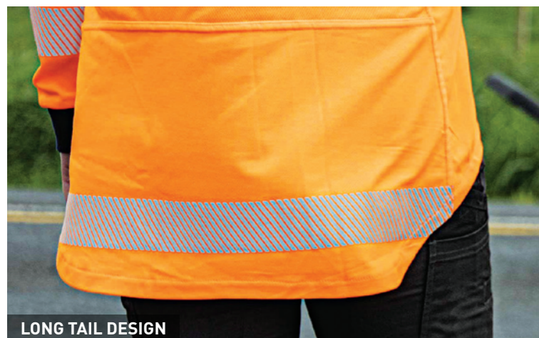
LONG TAIL DESIGN